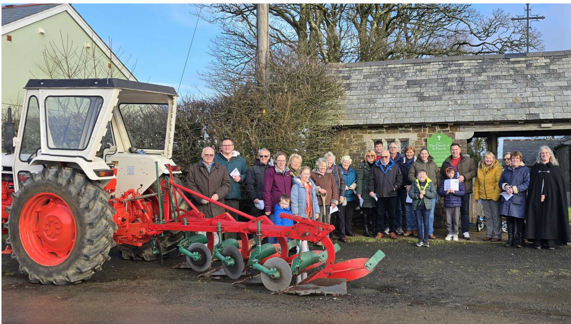
Photo – Plough Sunday Service, St Pancras Church, Pancrasweek